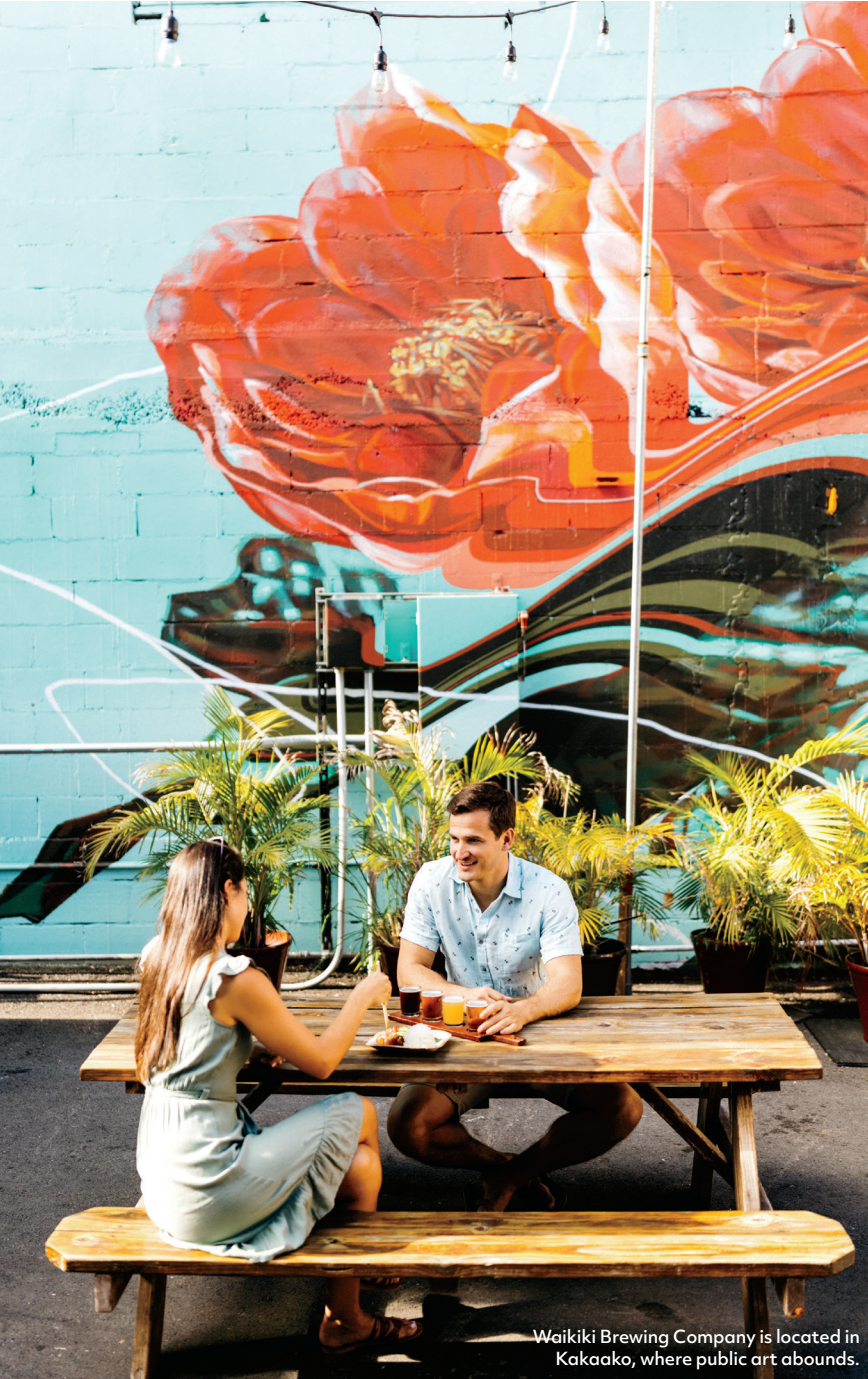
Waikiki Brewing Company is located in Kakaako, where public art abounds.